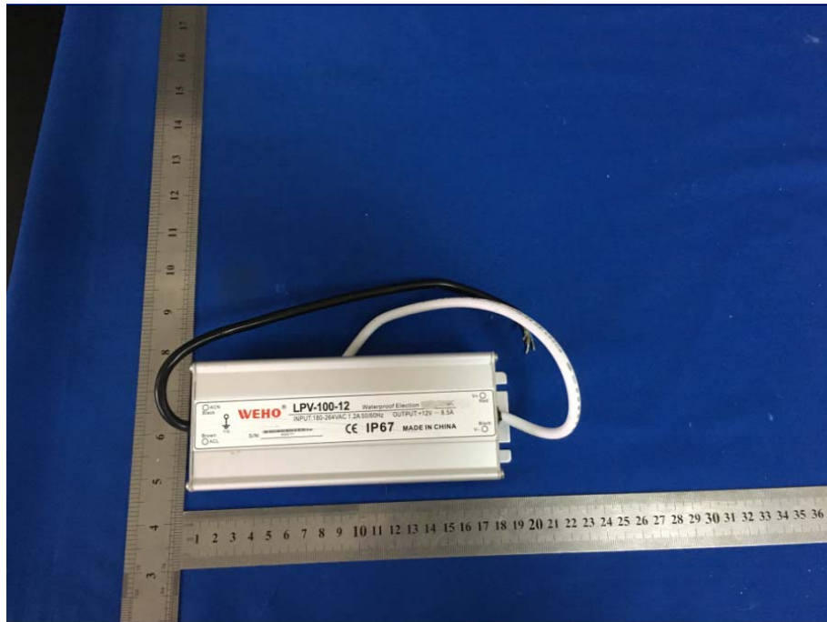
Photo 1 General Appearance of the EUT